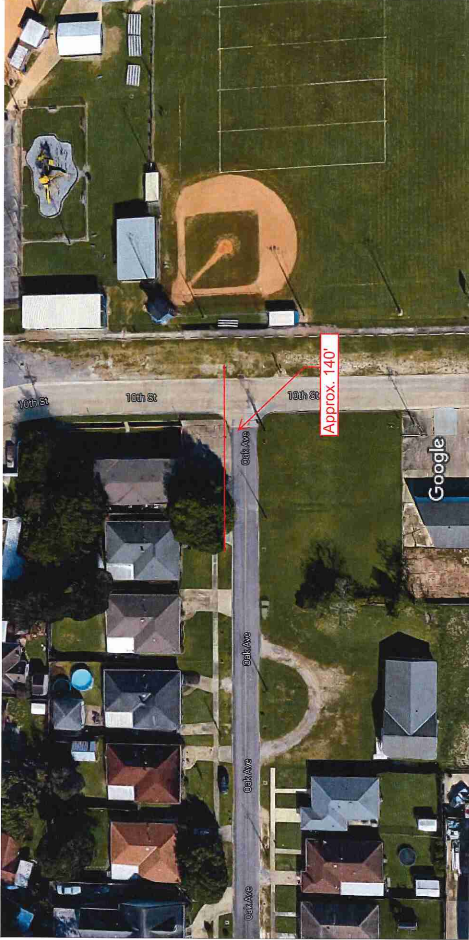
Imagery ©2016 Google, Map data ©2016 Google 20 ft